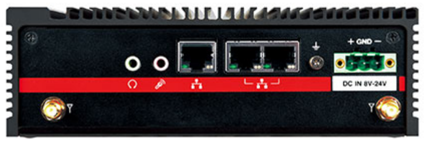
Support: Specifications | Expansion modules | Dimensions

MiTAC's MB1-10AP Embedded Box PC is the next generation box pc with Intel® Apollo Lake processor. The whole new SOC structure packs more powerful capability for your tasks or applications.